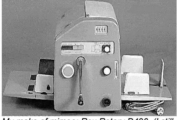
My make of mimeo: Rex Rotary D490. (I still have it, but no ink to print with...)

I have earlier commented upon the Winter Olympics. The Stockholm 2026 bid has finally gotten support by the Swedish government and public opinion in favour seems to go up. The opposing bid is from Milan, Italy. It is claimed that many really want Stockholm to win, since Sweden is the only major winter sport nation which hasn't yet hosted the Winter Games (Stockholm had the Summer Games,