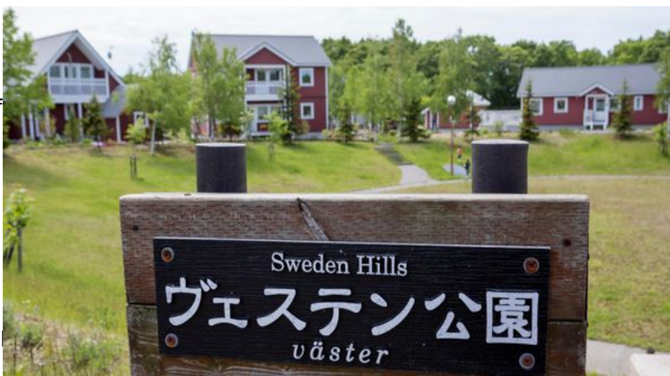
Championship in Minute-Long Films. This could be Sweden, with typical "Falu red" houses. But it is a Swedish Your reporter usually likes the minute area in Tobetsu, Japan. Doc film "Friends from Leksand" told us more.

In addition to this, the University of Dalarna became the best film school We also had the Swedish