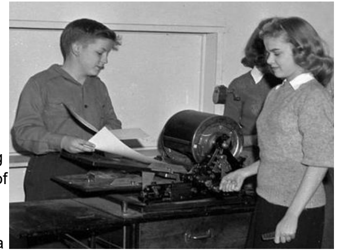
This is what it used to mean doing a fanzine!

Neofen today don't know how lucky they are...or unlucky, missing out those legendary days! It was hard work to do a fanzine a quarter of a century ago. Now you can do one in just minutes.