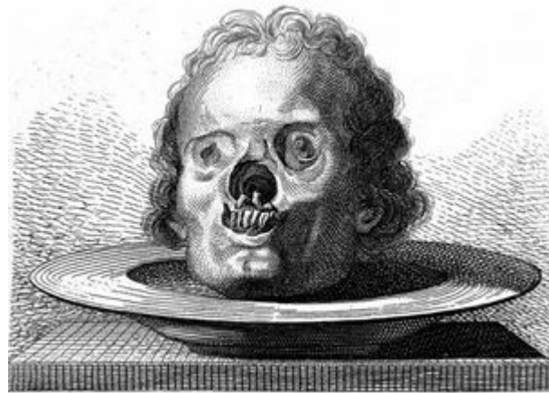
Old copperplate of a syphilis victim.

Venus is of course the goddess of love and the element Mercury was at the time the common treatment for syphilis. This disease can take different expressions and take time to "bloom" (but as not being too much into medicine I can't go into details about it). Alfred Nobel most certainly contracted it from a visit to a prostitute. Jangfeldt notes that the condition was known within the family, but kept a secret.