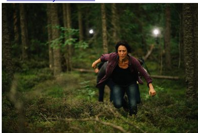
like here. Civilians flee through the woods in this Alternate History.