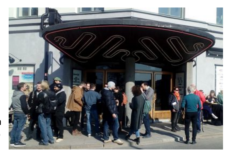
Many had come to Bio Rio this sunny weekend!

I remember back in school, it could have been 8th grade or something, our arts class was divided into groups and each got an 8 mm film camera and film and told to make a move. My group made