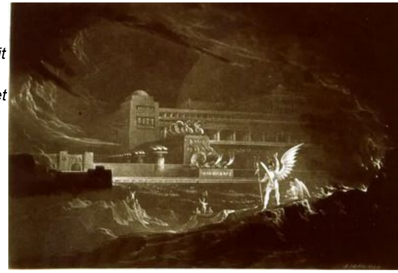
Illustration to Bulwer-Lytton's sf novel The Lost Race.

Doesn't this sound very, very much like a science fiction convention! There was a bazar (ie hucksters!), costumes, art of different sorts displayed (in this case objects and decorations around the Vril