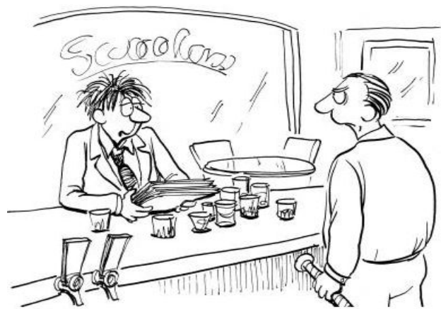
"I have no money to pay my tab, but reading while your thoughts are racing... I will give you a free reading of my novel." It's very difficult to write simple. Less is more, you know.

An example of the first category is one you haven't heard of, the Swedish writer Björn Ranelid. He often appears on TV breaking out in long tirades of - what he thinks - beautiful metaphors full of flowering adjectives. Ultimately becoming a parody of himself. The comedians love to imitate him. An example of a writer in the second category is the columnist we had in Teknikmagasinet in the 1980's, the space reporter Eugen Semitjov. It was my job to - as we called it - "wash" the manuscript with a pen in my hand, in the days of typewriters and paper. There were always things to fix. But